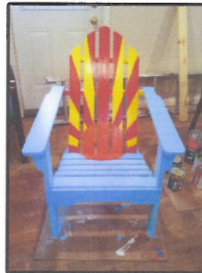
Here are just two of the chairs to be displayed in downtown Portland this summer

Want to enter a chair? Want to sponsor a chair and display it outside your business? Go to www.portlandcommunityarts.com for more information and an application form.